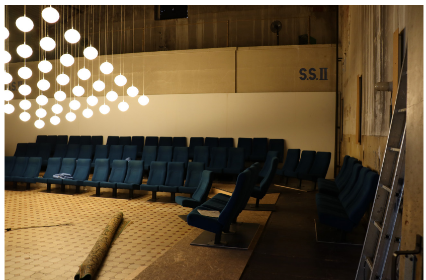
Event hall in the TRAFO

In addition to the accommodation on site, we provide you with a studio. One floor in the TRAFO is completely available for artistic activity. Its heart forms a large room with skylights (Oberlichtsaal), in which you can exchange ideas with the other artists. A hallway leads from this Oberlichtsaal to your individual work space (approx. 20 m 2 ). In addition to this work space, there are other rooms that can be used and explored. Overall, the TRAFO offers a usable area of approx. 400 m 2 .